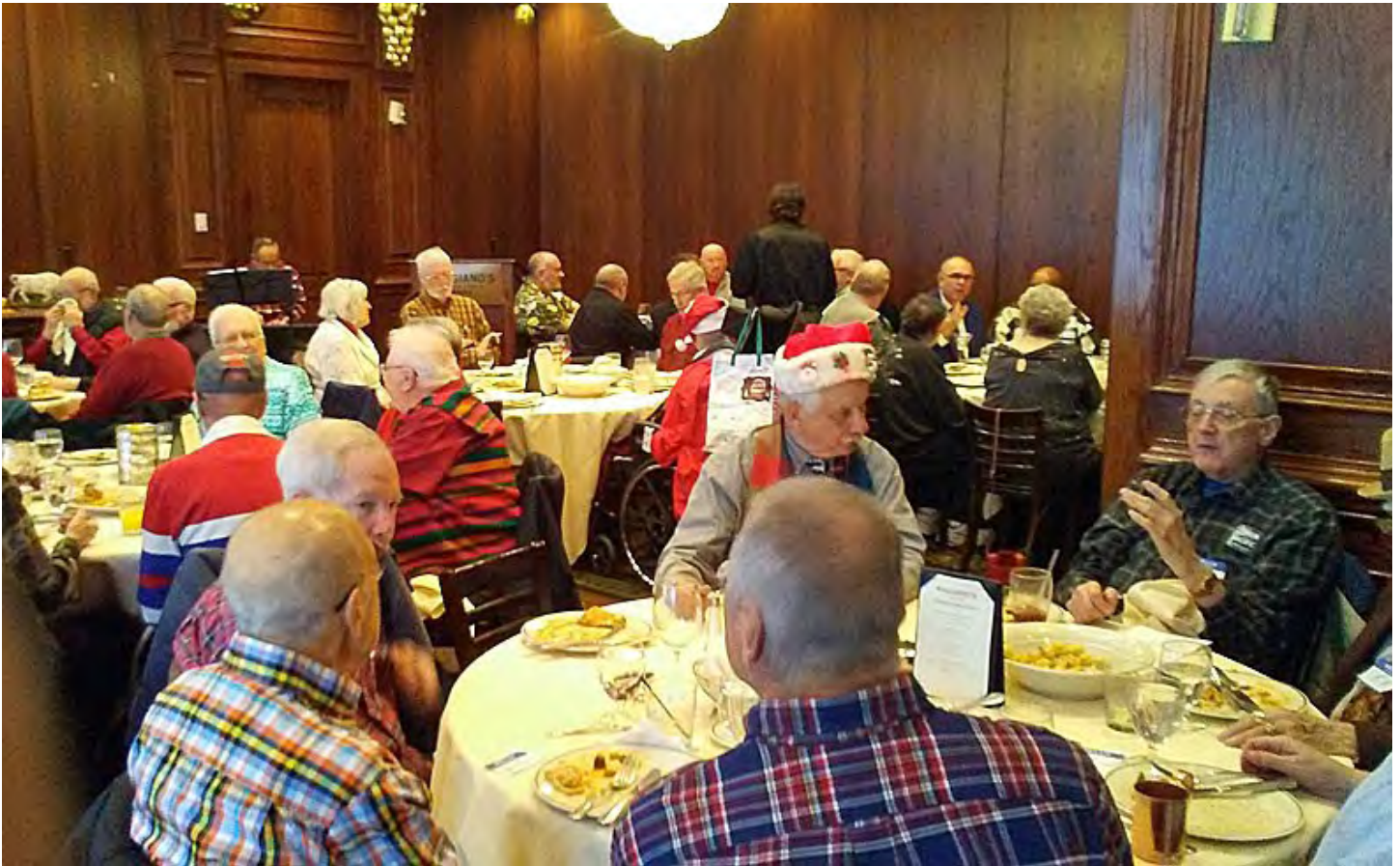
Colorado Prime Timers Christmas Party, December 14, 2019