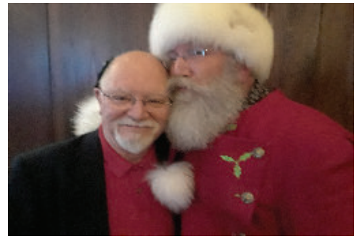
Is he being naughty or nice?